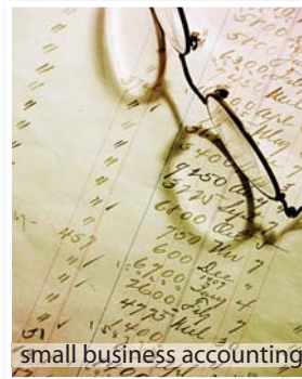
small business accounting