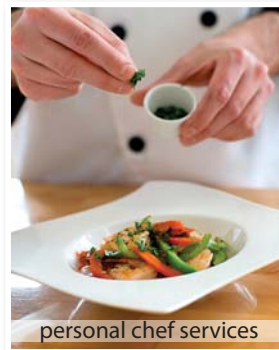
personal chef services